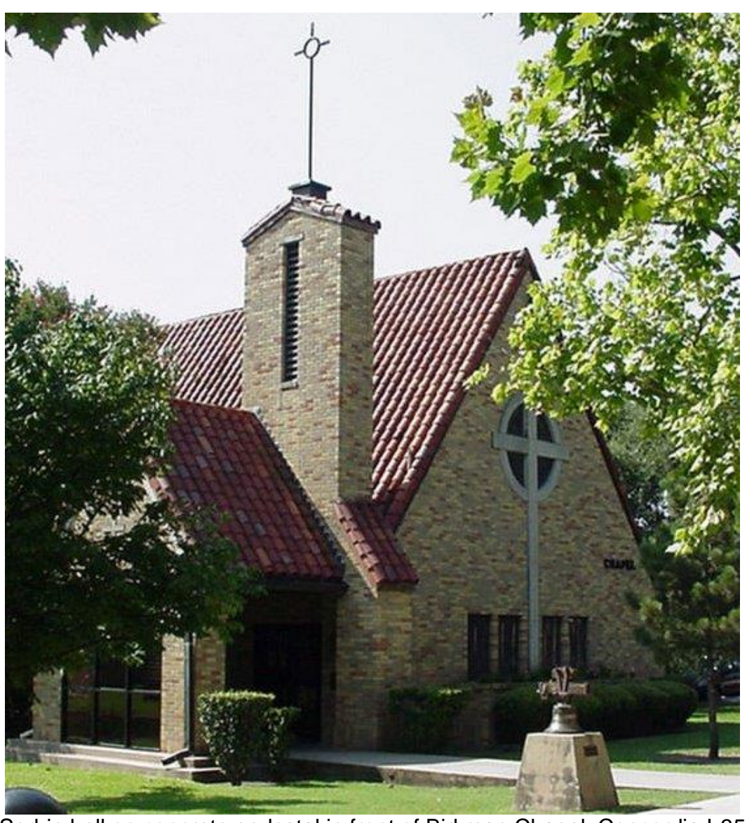
Serbin bell on concrete pedestal in front of Birkman Chapel, Concordia I-35